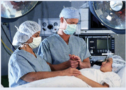
Collapsible isolation chambers