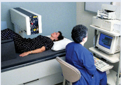
Air cleaner as recirculation unit