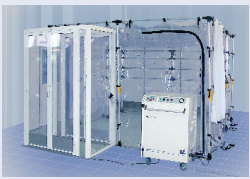
Low cost isolation rooms